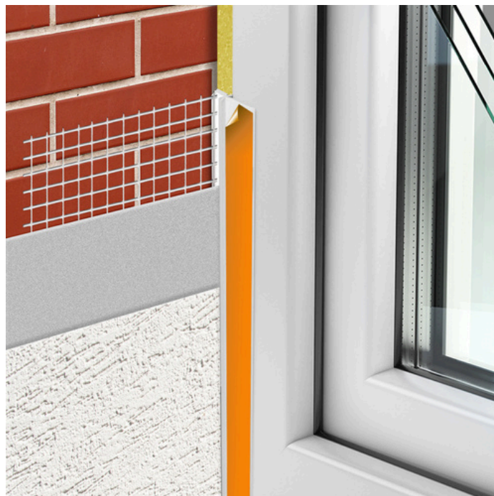
Functional graphics for products: PVC P6/3U+S and PVC P9/6U+S.